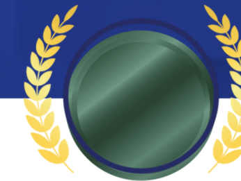
EXHIBIT BOOTH SPONSORS $1,500